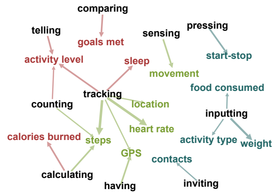
Figure 3: The relationships between data types and the verbs participants used to describe how the tracker records each data type. Arrow thickness indicates the number of participants who mentioned a connection between a pair of data types. Entered data types are blue, measured are green, and calculated are red.

When participants described how an activity tracker might know a certain type of information or described the relationship between a pair of data types, they often used verbs to describe the nature of the relationship. We created a second visualization (Figure 3) depicting co-occurrence between the data types and the verbs they mentioned. Arrows point from the verb to the data type, and the thickness of the arrows represents how many participants used a particular verb. For example, the verb “inputting” was used to describe how the tracker knows the user’s weight. The verb “tracking” was used in conjunction with 6 different data types (steps,